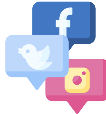
Social media content