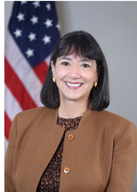
Monica Bertagnolli, MD Director, National Institutes of Health (NIH)