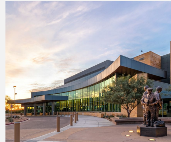
PHOENIX & SCOTTSDALE ARIZONA