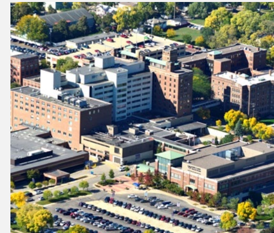
HEALTH SYSTEM MINNESOTA • IOWA • WISCONSIN